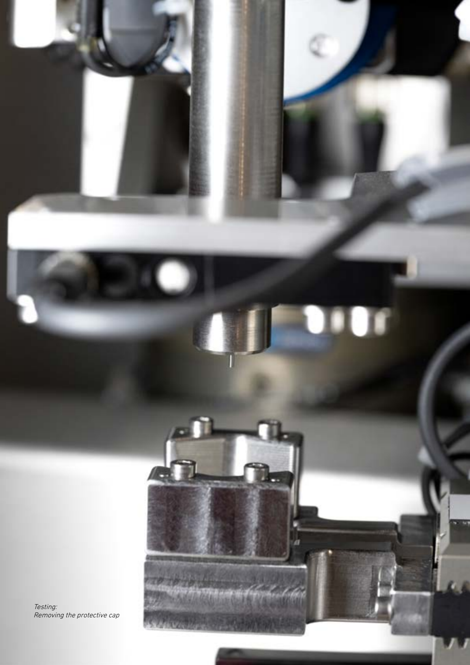
Testing: Removing the protective cap