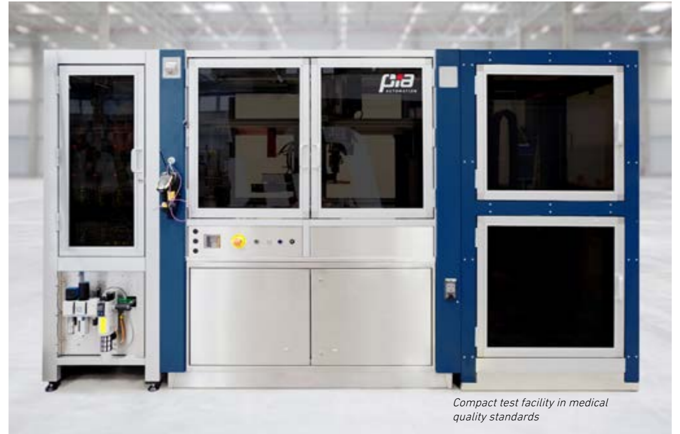
Compact test facility in medical quality standards

The new system will go into operation at the customer's premises in the coming months. With it, PIA is continuing a very good collaboration that began back in 2010 and, since then, PIA Automation has also developed and installed several assembly and automated testing systems for this customer.